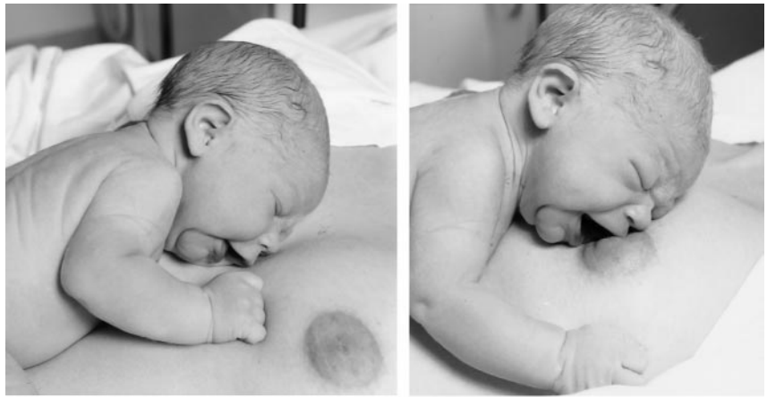
Fig 1. An infant boy <1 hour old crawls up his mother's body and latches onto her breast by himself, clockwise from left.